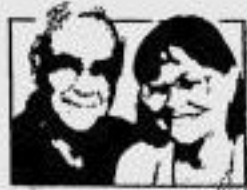
HOLLIDAY & FISCHER

● Swiss Army Knife. You can never go wrong with a compact multi-function knife that incorporates a bottle opener and corkscrew. One that really caught our eye has 34 different tools ... and at one time or another, we could have used each of them. To fix our eyeglasses, adjust our brakes, cut fingernails, or whatever. The Swiss Army Multi Tool